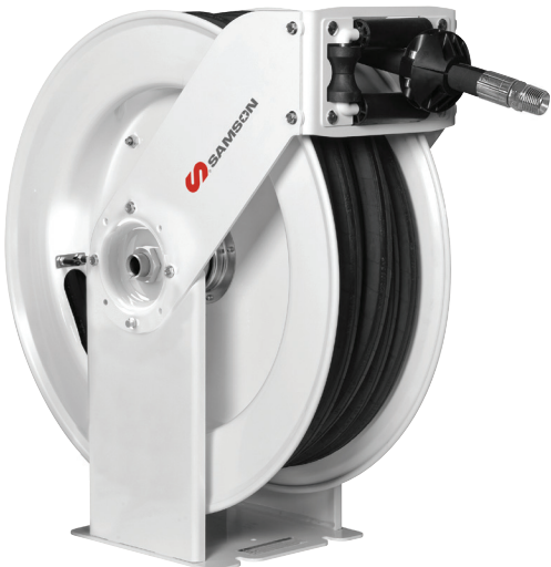
Roller arm in tank/wall mount position